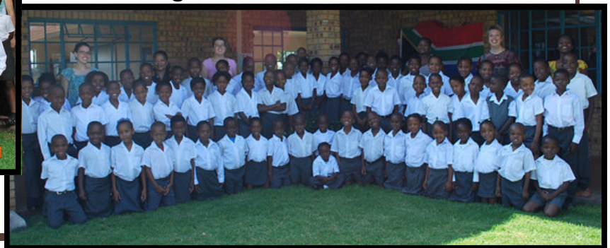
JCA 2010 All school picture