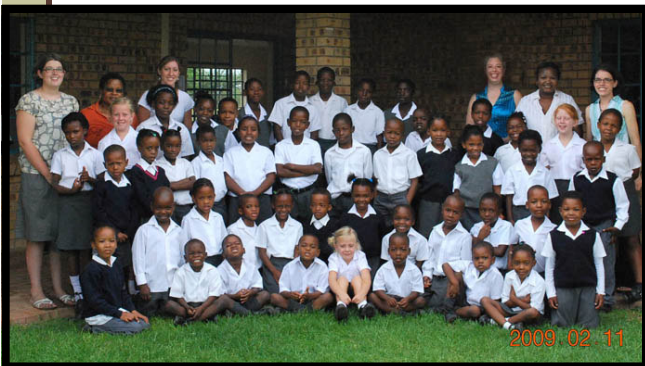
Look how we've grown! JCA 2009 All school picture

for "Get Involved," click on "Give Now"); or you can send a check to Evangelical Baptist Mission. In either case, please designate your gift for the "Construction of the School Building."